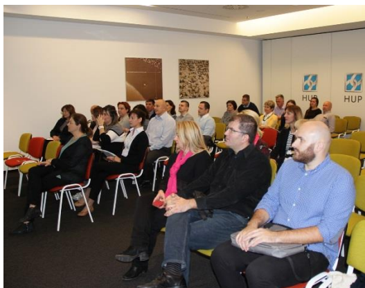
Croatian National skillME Conference 29 September 2017, Zagreb (Croatia)

National project partner teams also held national conferences for presenting project outputs and achievements to their national stakeholders. The conferences generated much interest and were well-attended by companies interested in training their employees, VET providers interested in implementing trainings for their students, as well as various other stakeholders.