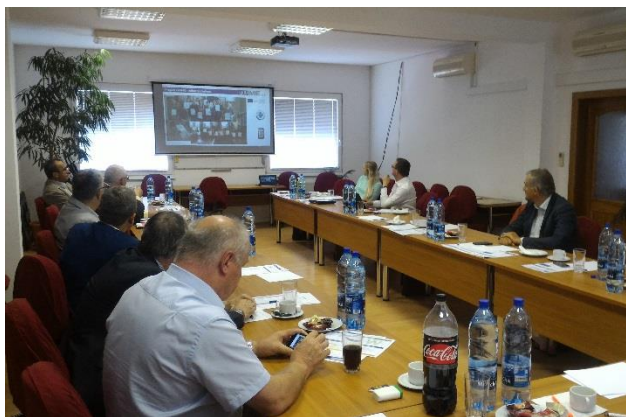
Slovak National skillME Conference 6 October 2017, Pezinok (Slovakia)